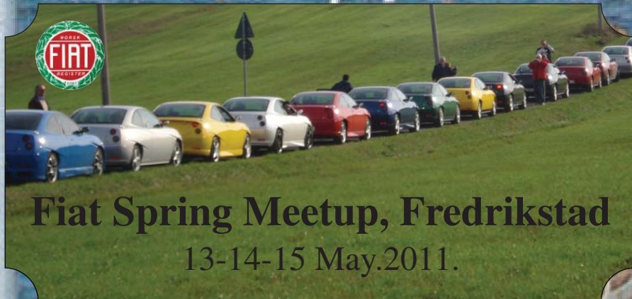
Fiat Spring Meetup, Fredrikstad 13-14-15 May.2011.